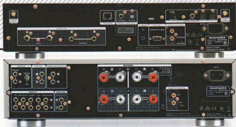
ABOVE: Network/CD player/DAC [top] has Ethernet, Bluetooth Wi-Fi, two optical, one coaxial and USB digital inputs alongside optical/coaxial digital outs and fixed/variable analogue outs (on RCAs). Amp [below] includes MM phono, four line, one tape loop, pre out/power amp in and A/B sets of 4mm speaker binding posts