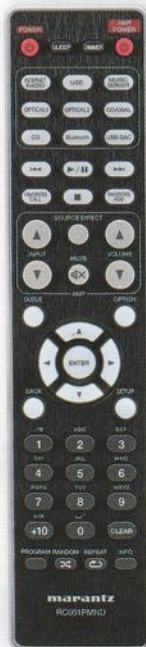
LEFT: System remote control governs all 8000 series components, including access to extra features