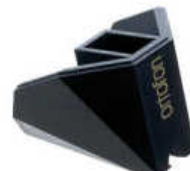
2M Black / Verso