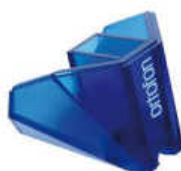
2M Blue / Verso