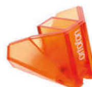
2M Bronze / Verso