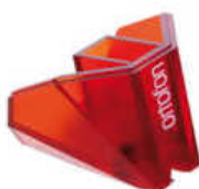
2M Red / Verso