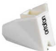
2M Mono / Verso