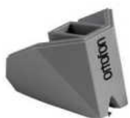
2M 78 / Verso

The 2M Bronze features a Nude Fine Line diamond stylus, which is particularly suited for demanding applications. The