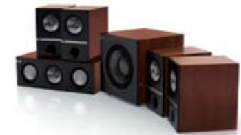
Q100 5.1 Package.