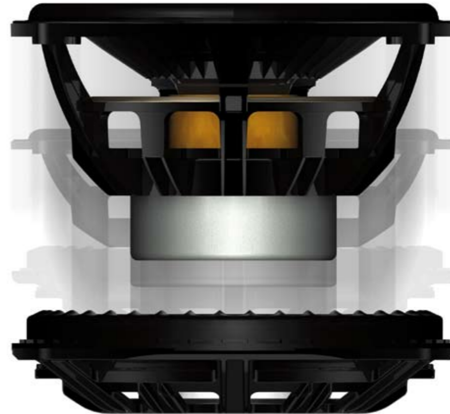
KEF's patent pending ultra-slim bass driver

Instead of a cone, the radical new twin-layer bass and midrange unit has a flat diaphragm whose rigidity throughout the frequency range is maintained by very fine stiffening ribs, with the driver as a whole acting as a stressed member to help eliminate any unwanted resonance from the slim cabinet. The resulting response is as clean, accurate and distortion-free as a quality conventional speaker, with none of the bulk.